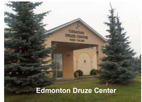
Edmonton Druze Center