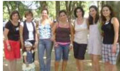
ADS ladies gathered for a photo shot at the picnic.