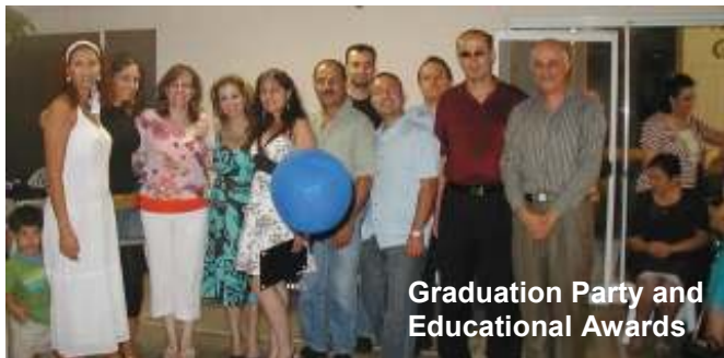
Graduation Party and Educational Awards