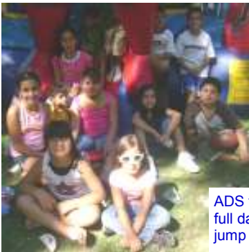
ADS future generation is taking a break from a full day of fun where they have enjoyed the jump house and nearby Thunderland park